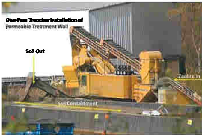
TRENCHING — Illustration of trenching operations with arm fully extended into the ground. Dirt is removed out the front of the trencher, while zeolite is placed immediately behind the excavated soil, which is placed in an above-ground containment unit.