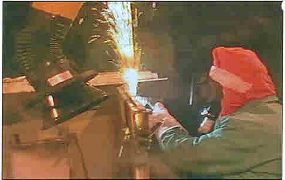
A worker is shown plasma cutting in the Container Size Reduction Facility (CSRF) at the West Valley Demonstration Project site in southwestern New York state.