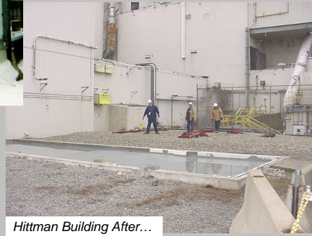
Hittman Building After...