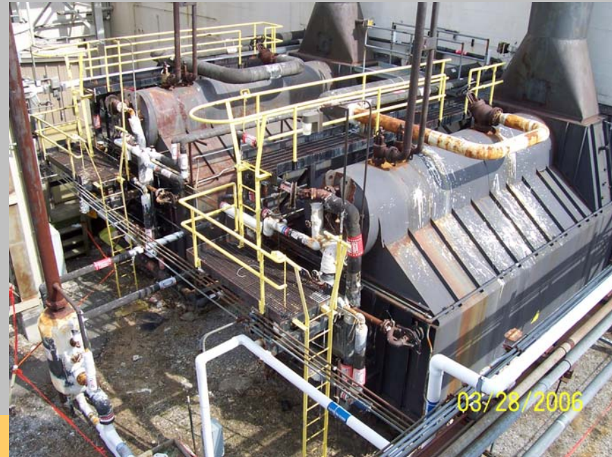
Boiler Being Prepared for Removal