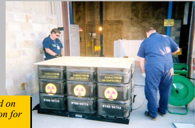
Drums are loaded on pallet in preparation for shipment