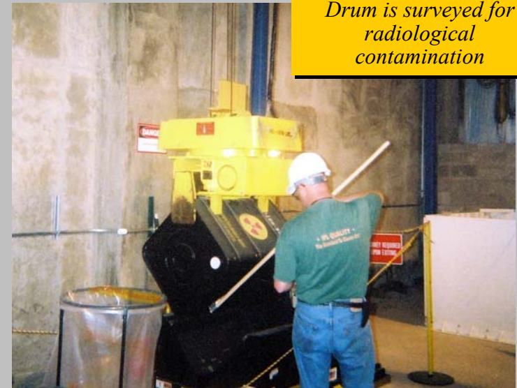
Drum is surveyed for radiological contamination