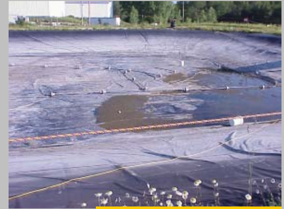
Lagoon 4 Before and After