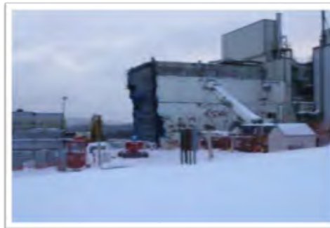
Vitrification Facility March 13, 2018