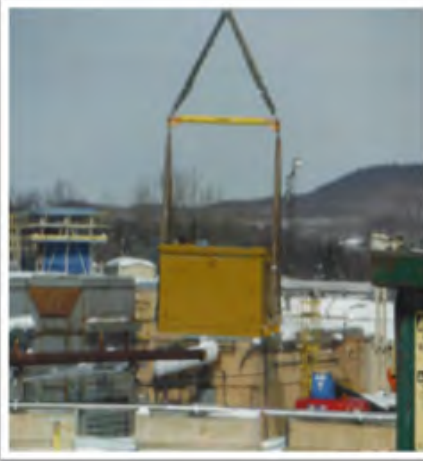
Moving waste box to storage hardstand March 5, 2018