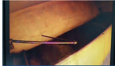
South Ledge Before Decontamination