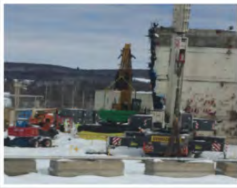
Placing cooler into waste box March 5, 2018