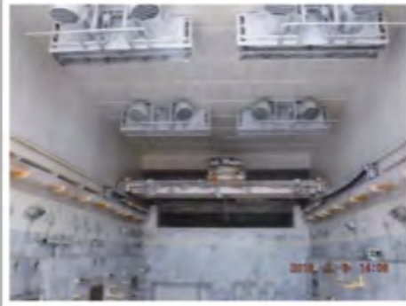
(Left) Inside view of Vitrification Facility cell and (Right) associated coolers (4) February 6, 2018