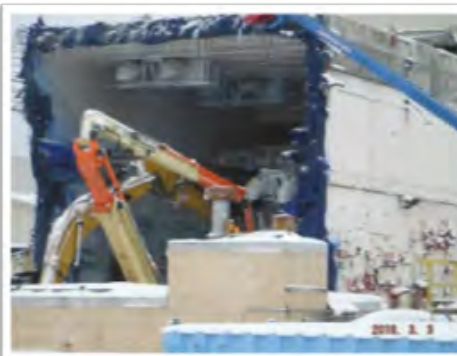
Cooler being lowered to Vitrification Facility floor before being placed into an approved waste container March 3, 2018