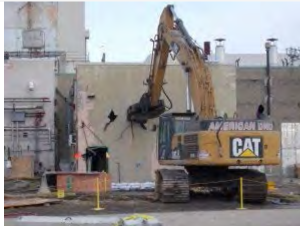
Crews begin demolition on the laundry facility.

WEST VALLEY – EM and its cleanup contractor CH2M HILL BWXT West Valley, LLC recently completed the demolition of the former laundry facility at the West Valley Demonstration Project. This is the third of seven ancillary support structures to be demolished under the current contract. Laundry operations stopped in 2012 when it was outsourced to a private contractor as a cost-savings measure.