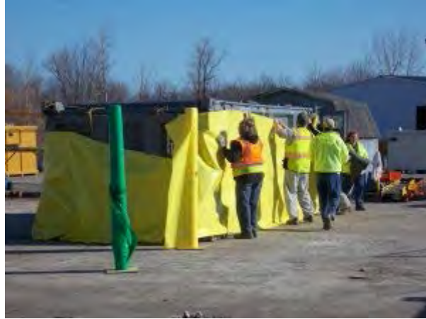
A crew prepares a waste container for vitrification facility demolition debris.

Completing work at the vitrification facility and doing the work safely has been a priority for CHBWV crews. Pillittere is grateful for the hard work the crews at the WVDP have completed so far and the safety precautions taken on a daily basis.