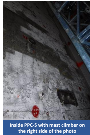
Inside PPC-S with mast climber on the right side of the photo