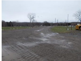
Graded area for topsoil and seeding in the Spring (April 2022)