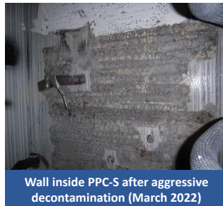
Wall inside PPC-S after aggressive decontamination (March 2022)