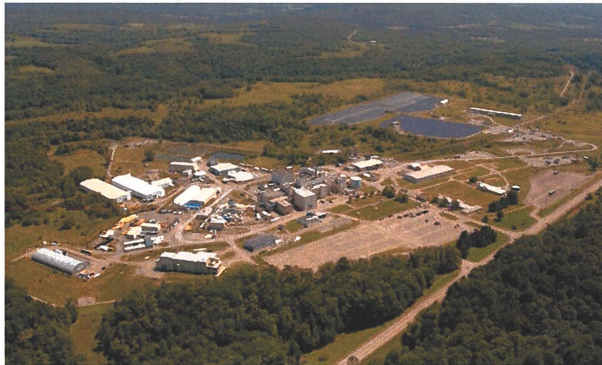
An aerial view of the West Valley Demonstration Project.

WEST VALLEY, N.Y. – EM's cleanup contractor at the West Valley Demonstration Project earned $225,000 of a possible $461,080 award fee for its March through August 2018 performance period, according to a recently released scorecard.